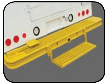
Grip Strut with Pull Down Step and Hitch