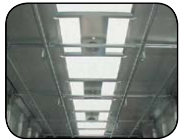
24" Skylight x Body Length