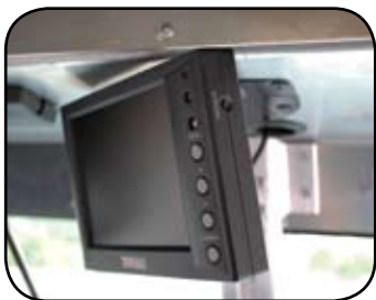
Back Up Monitor