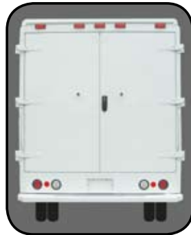
Full Width Swing