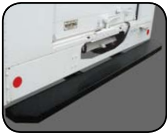
Tread Plate Bumper