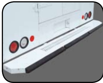
Tread Plate with Grip Strut and Rubber Bumpers