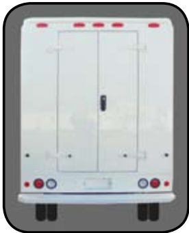
Twin 20" Swing