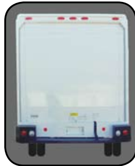
Full Width Roll-Up