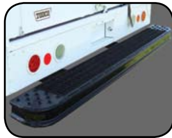
Grip Strut Bumper