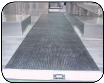
Cargo Floor Mat Center Aisle