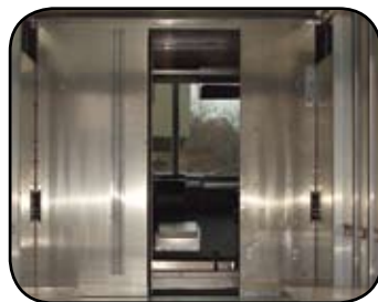
Full Bulkhead / Door