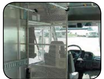
Partial Mesh Bulkhead