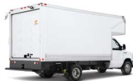
PARCEL DELIVERY VAN