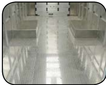
Tread Plate Overlay