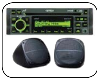
Radio/CD Player and 5" Speakers