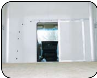
26x47 Bulkhead Cutout with Door