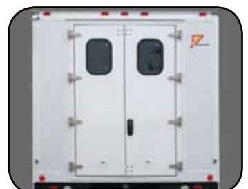
Heavy-Duty Rear Swing Doors