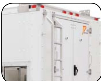
Rear Access Ladder