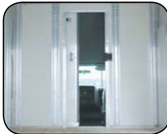
Full-Height Bulkhead Door (Aerocap only)