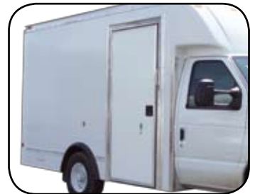
Side Entry Door