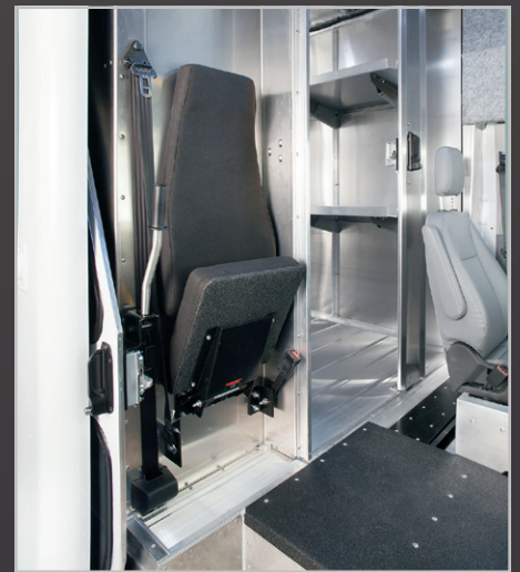
Optional jump-seat, level cab to cargo area transition with non-slip grit surface