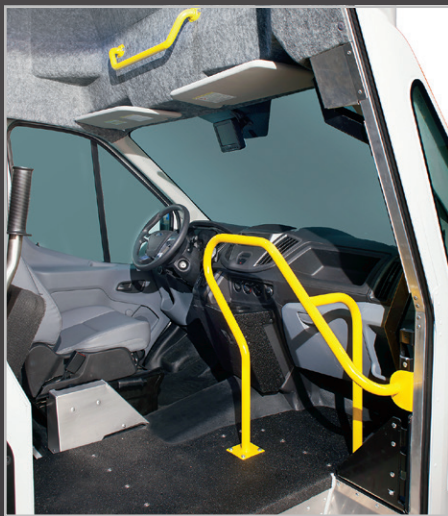
42" wide sliding door opens to spacious cab area with Three Points of Contact grab bars