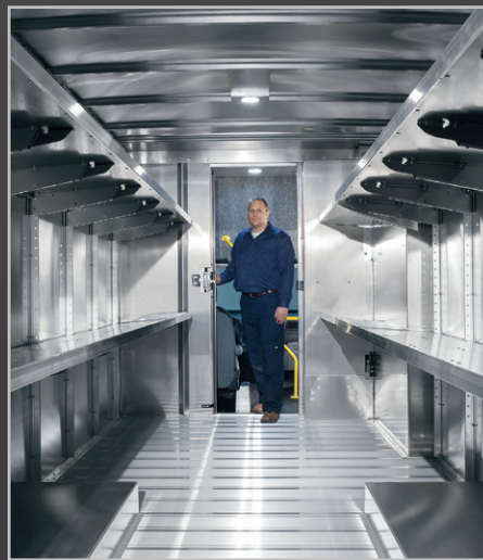
Heavy duty shelving and sliding bulkhead door with Kason latch