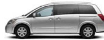
3.5 SL: REWARDS FOR EVERYONE