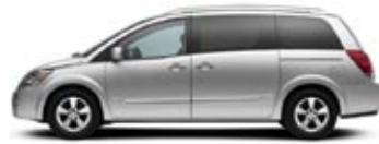
3.5 S: MORE CONVENIENCE