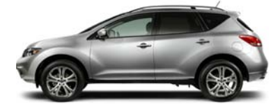
LE: PORTRAIT OF LUXURY