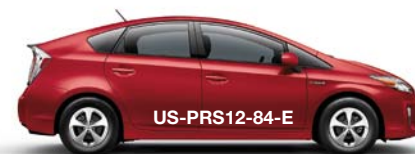
BARCELONA RED METALLIC