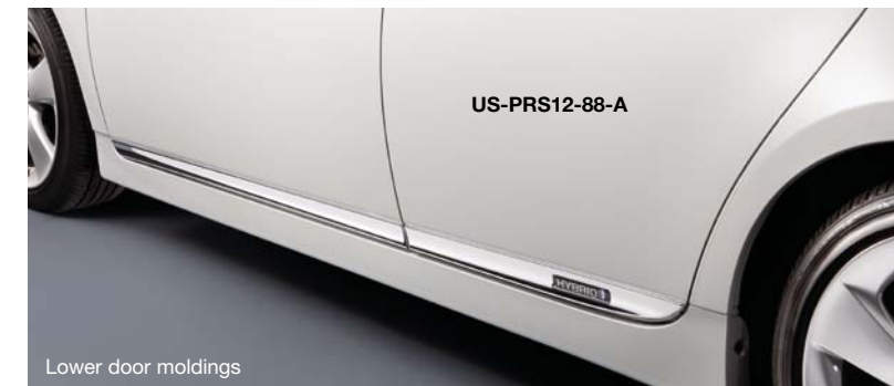
Lower door moldings