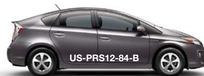
WINTER GRAY METALLIC