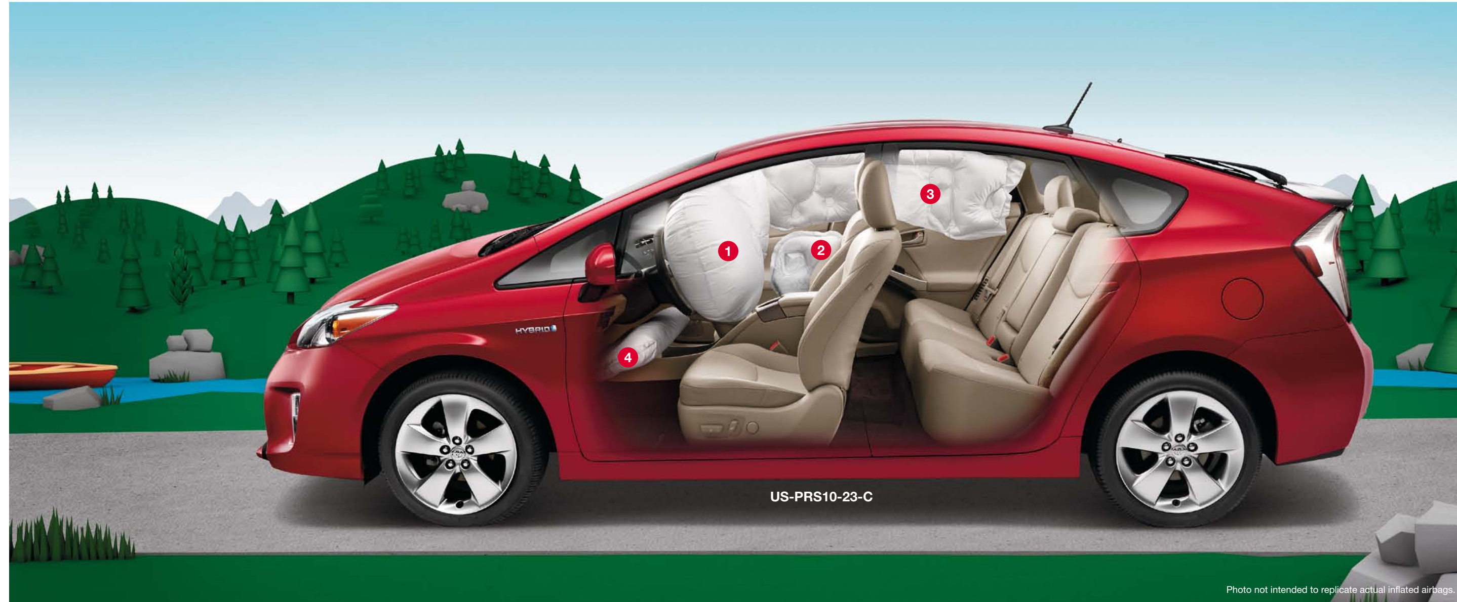
Photo not intended to replicate actual inflated airbags.

The 2012 Prius was named a 2012 Top Safety Pick by the Insurance Institute for Highway Safety (IIHS) 5 . To earn this coveted designation, a vehicle must have "good" ratings in all four Institute tests: high-speed front and side crash tests at low speeds, a rollover test, plus evaluations of seat/head restraints for protection against neck injuries in rear impacts.