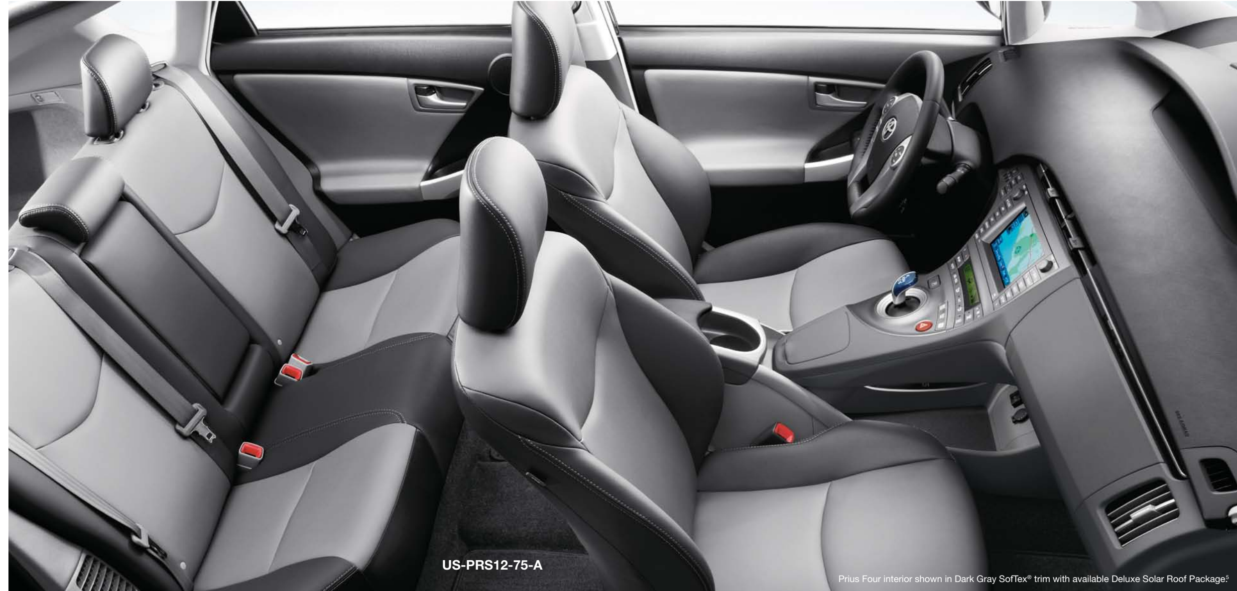
Prius Four interior shown in Dark Gray SofTex® trim with available Deluxe Solar Roof Package 5