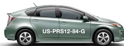
SEA GLASS PEARL