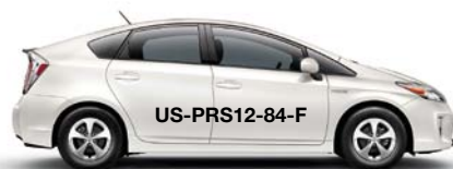
BLIZZARD PEARL (extra-cost color)