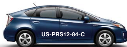
NAUTICAL BLUE METALLIC