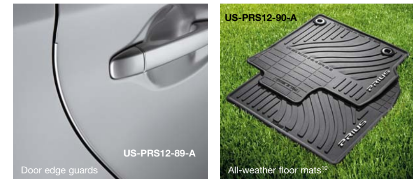
Door edge guards