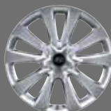
19" HYPER SILVER ALLOY WHEEL