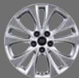
18" HYPER SILVER ALLOY WHEEL