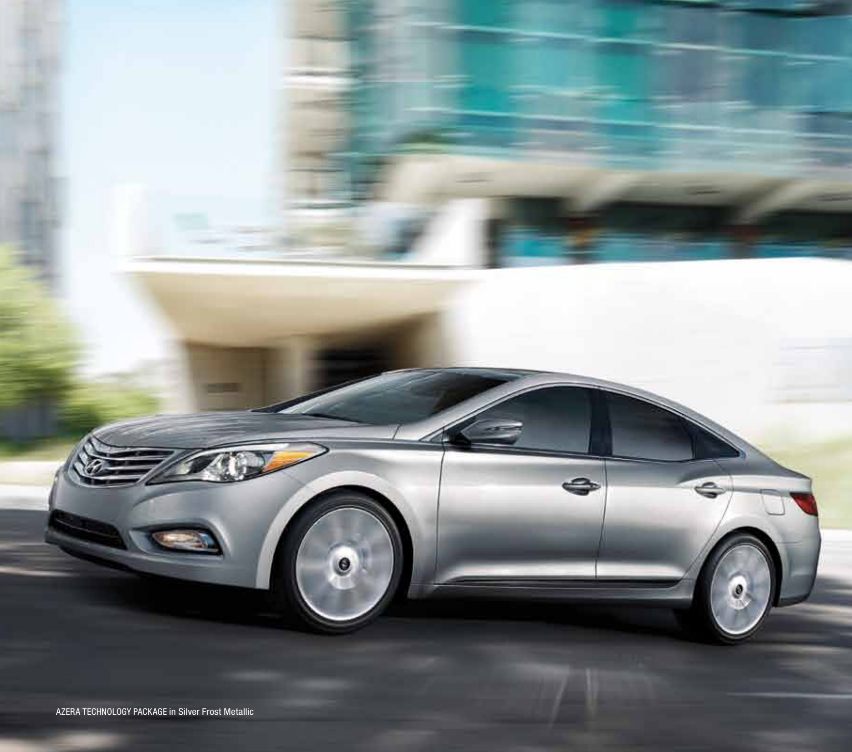
AZERA TECHNOLOGY PACKAGE in Silver Frost Metallic