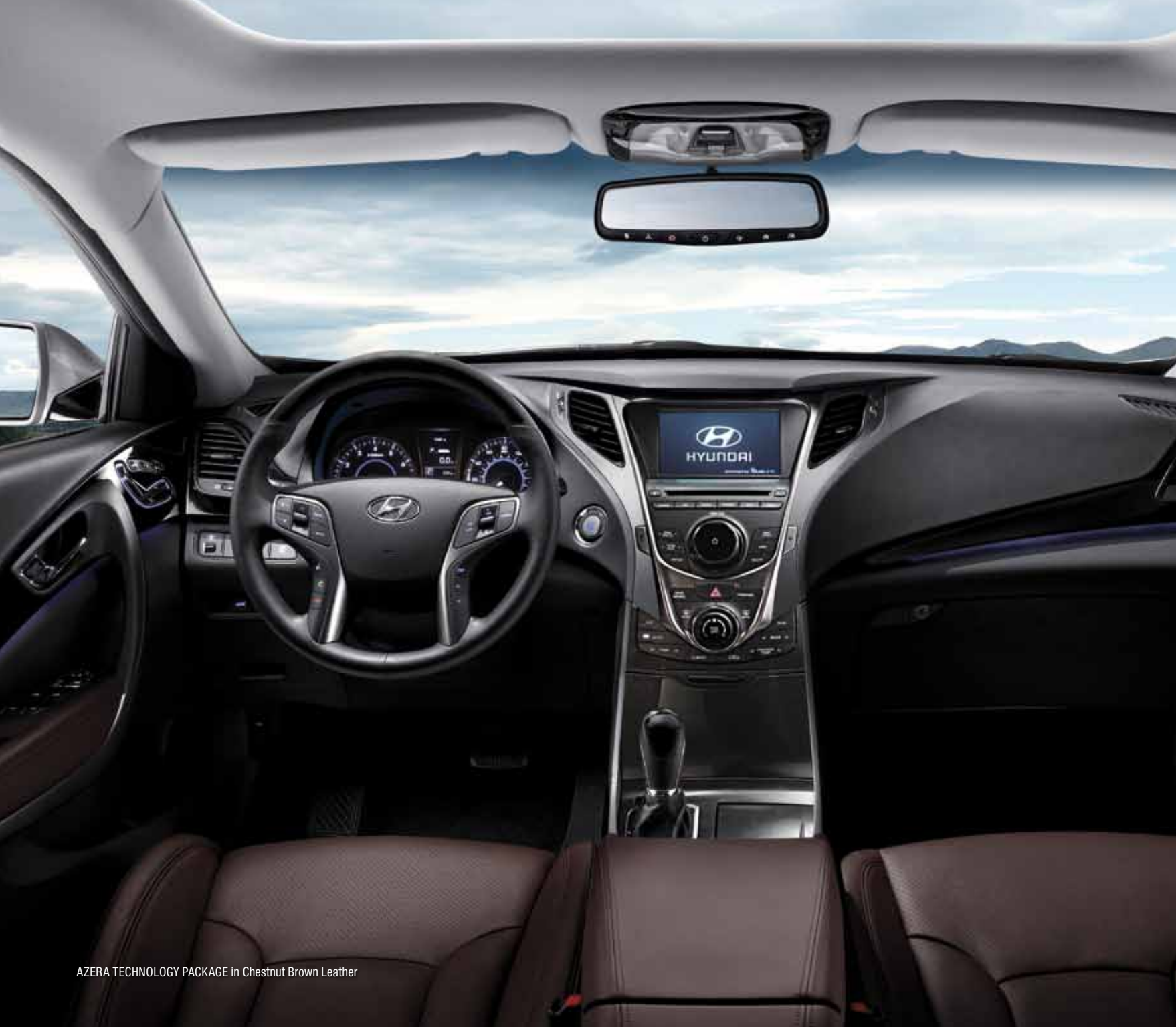
AZERA TECHNOLOGY PACKAGE in Chestnut Brown Leather