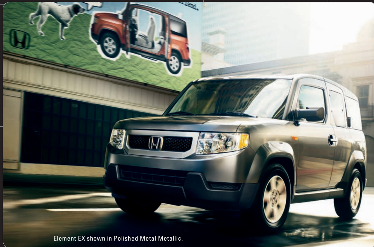
Element EX shown in Polished Metal Metallic.

An efficient 2.4 liter i-VTEC® engine gives the Element its go power. More adventurous drivers can opt for the available Real Time™ 4-wheel drive system, which senses front-wheel slippage and automatically sends power to the rear wheels to keep you on your way (LX, EX).