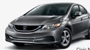
Civic Natural Gas