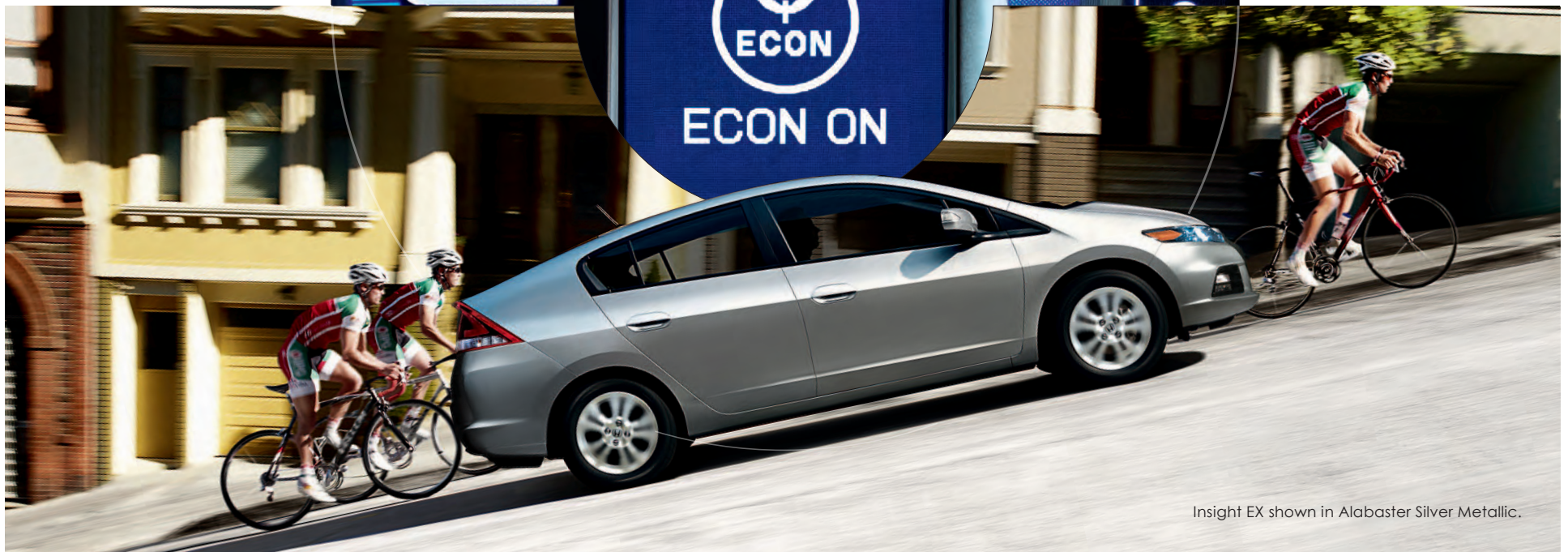
Insight EX shown in Alabaster Silver Metallic.

EPA numbers are important, but how you drive also affects your fuel economy.² The Insight features the remarkable Eco Assist™ system so you can monitor your driving habits, make adjustments and help boost your efficiency.²