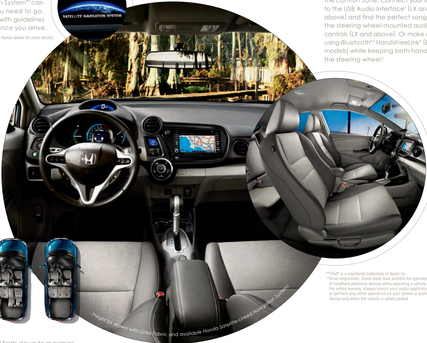
Insight EX shown with Gray Fabric and available Honda Satellite-Linked Navigation System!

It's a Honda, so "fun to drive" is built right in. The leather-wrapped steering wheel and racing-inspired paddle shifters (EX and above) will put the joy back into any commute. Or simply keep it in Drive and let the smooth continuously variable transmission (CVT) do all the work.