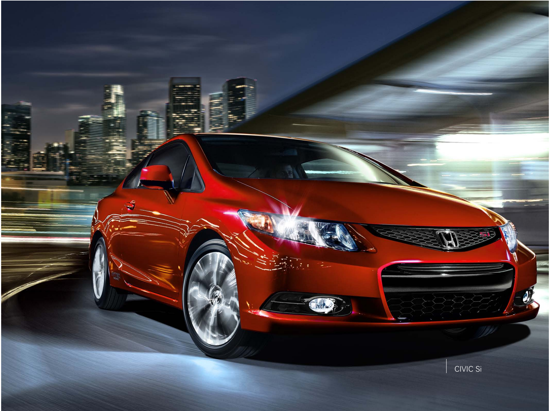
| CIVIC Si