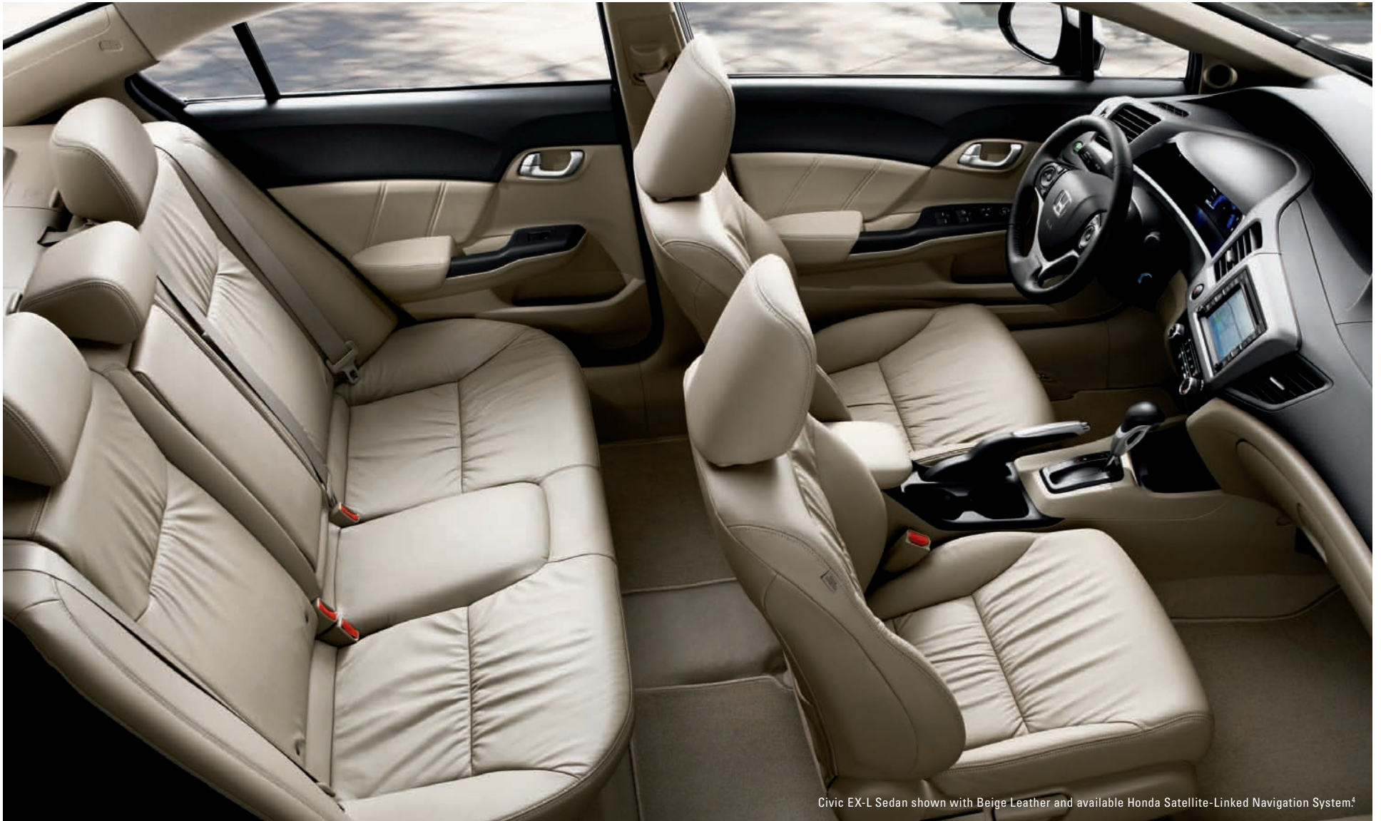
Civic EX-L Sedan shown with Beige Leather and available Honda Satellite-Linked Navigation System. 4

Escape pod? Command post? Personal sanctuary? All of the above? We outfitted Civic with thoughtful tools for a life on the go. How you use them is up to you. Your Civic will be what you make it.