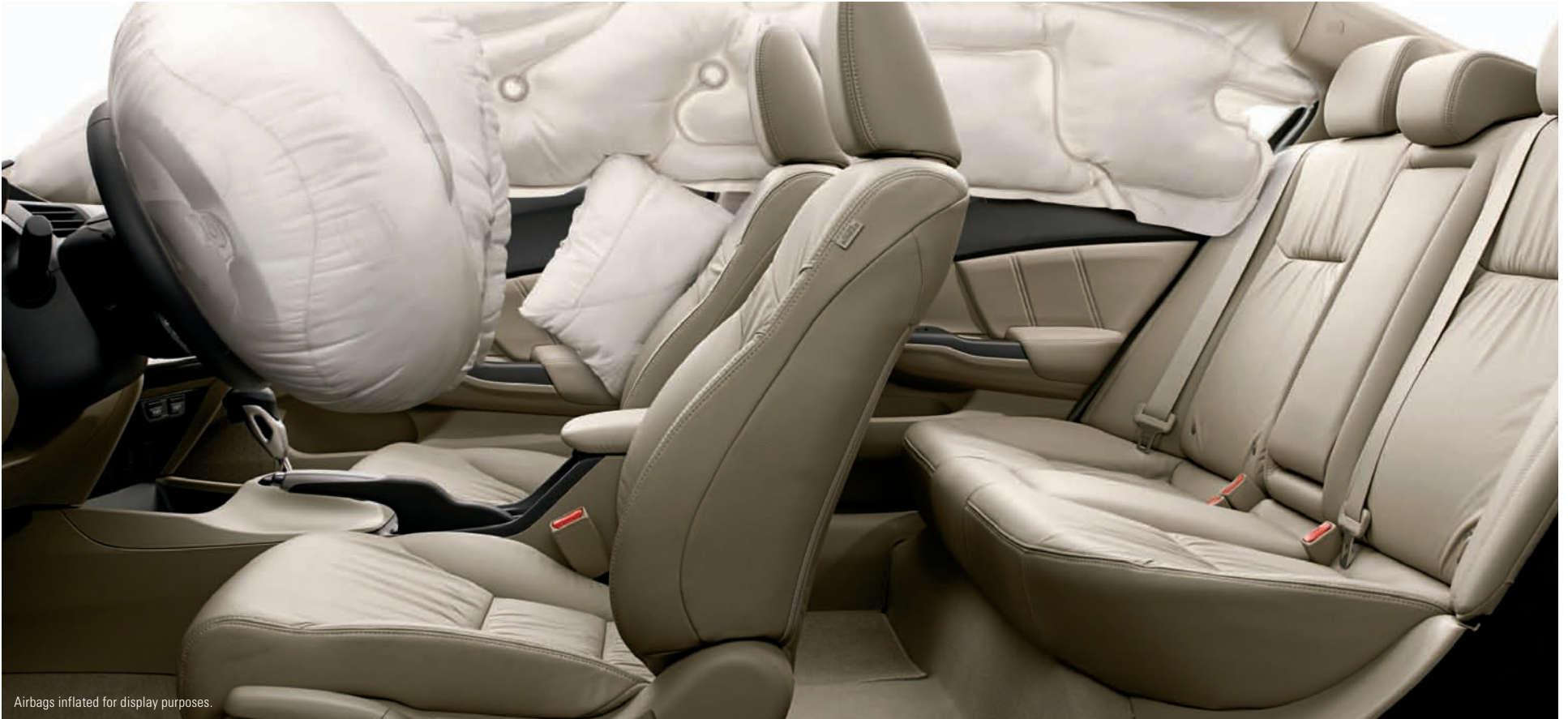
Airbags inflated for display purposes.

The Honda-exclusive Advanced Compatibility Engineering™ (ACE) body structure enhances occupant protection and crash compatibility in frontal collisions.