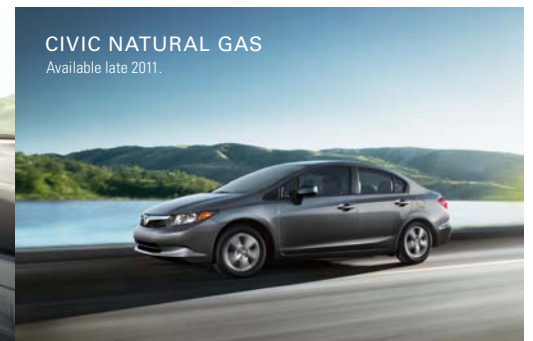
CIVIC NATURAL GAS Available late 2011.