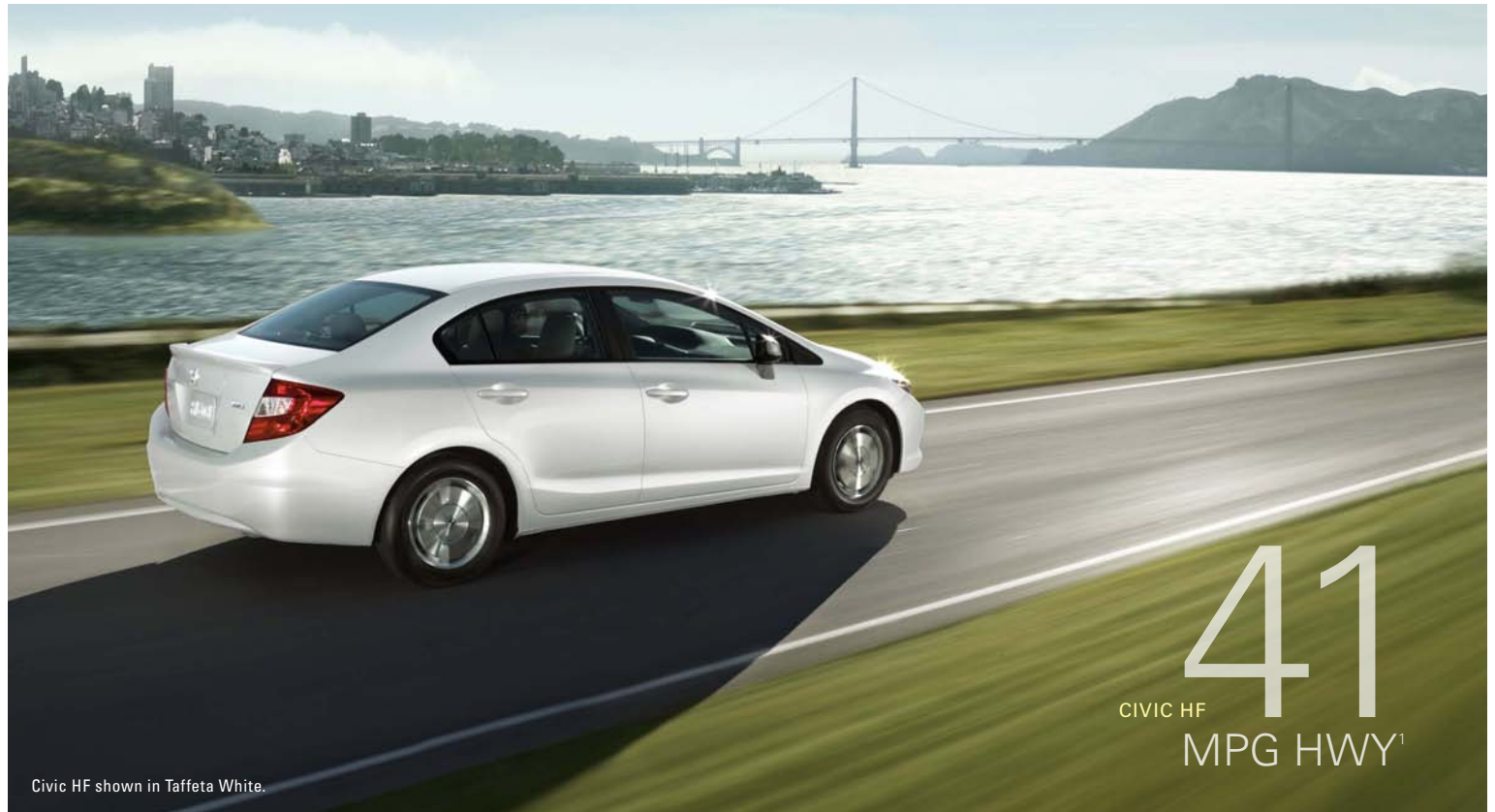
Civic HF shown in Taffeta White.