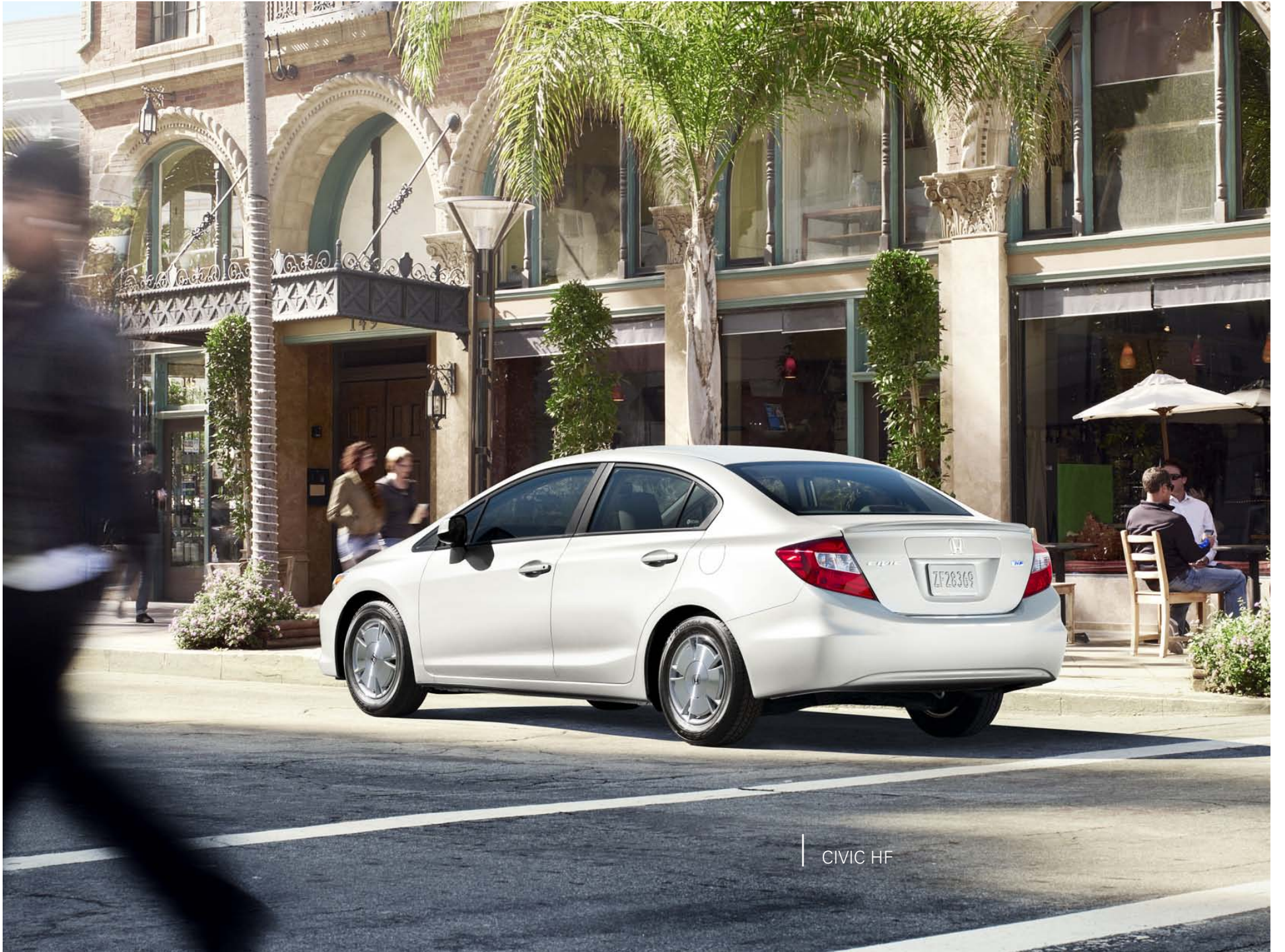
| CIVIC HF