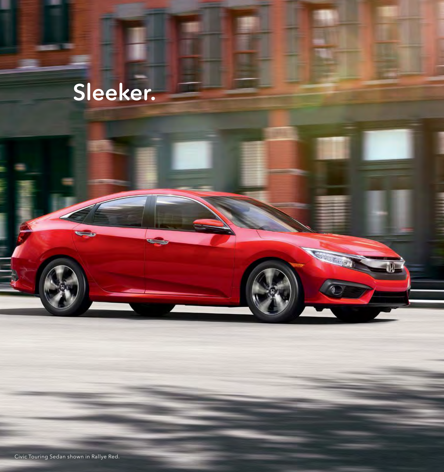
Civic Touring Sedan shown in Rallye Red.