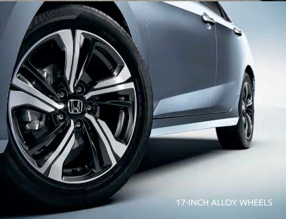
17-INCH ALLOY WHEELS