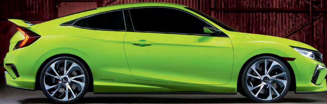
Civic Coupe concept shown in Energy Green Pearl.

Arriving in early 2016, the redesigned Civic Coupe promises to be the most fun-to-drive Civic yet.