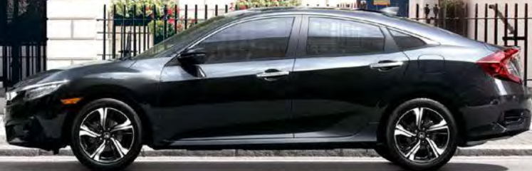
Civic Touring Sedan shown in Crystal Black Pearl.

With an aggressive new exterior and available new turbocharged engine, the redesigned 2016 Civic never plays catch-up.