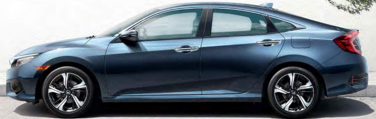
Civic Touring Sedan shown in Cosmic Blue Metallic.