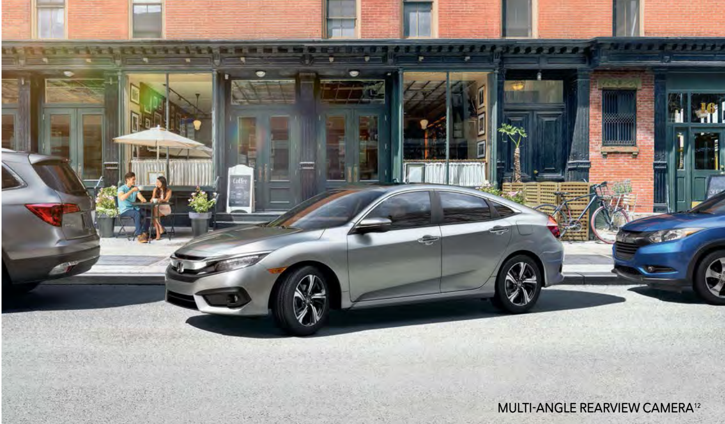
MULTI-ANGLE REARVIEW CAMERA 12