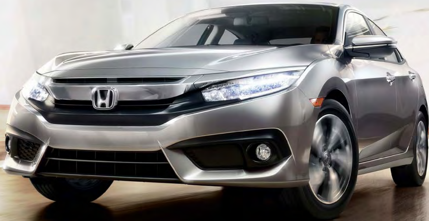
Civic Touring Sedan shown in Lunar Silver Metallic.