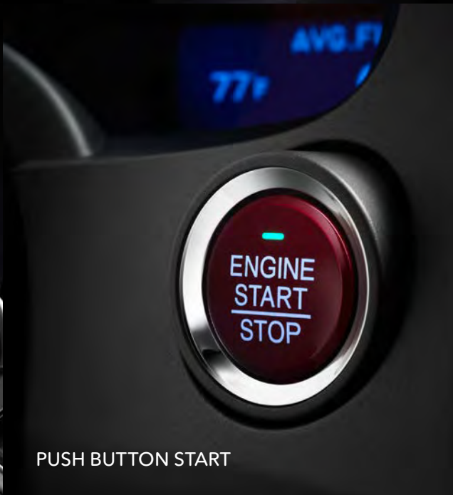
PUSH BUTTON START