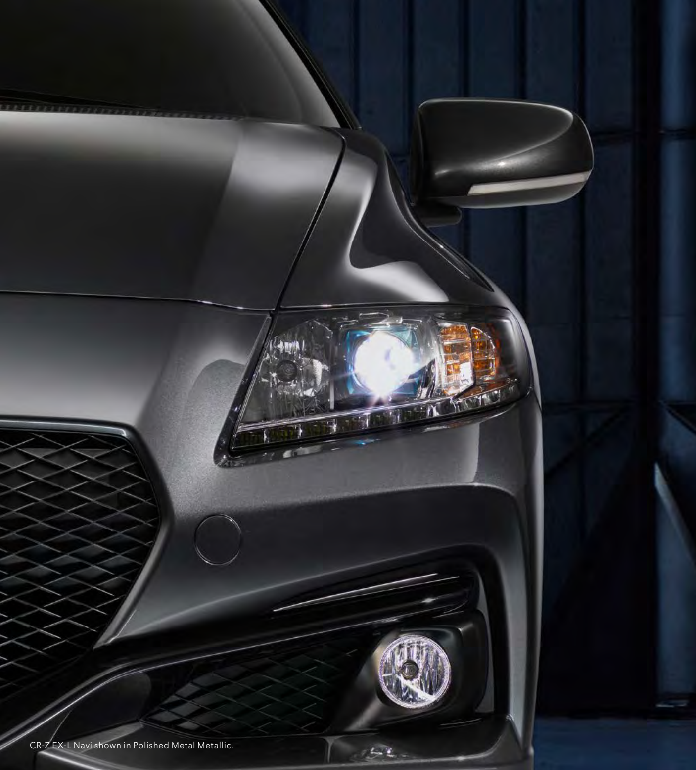
CR-Z EX-L Navi shown in Polished Metal Metallic.