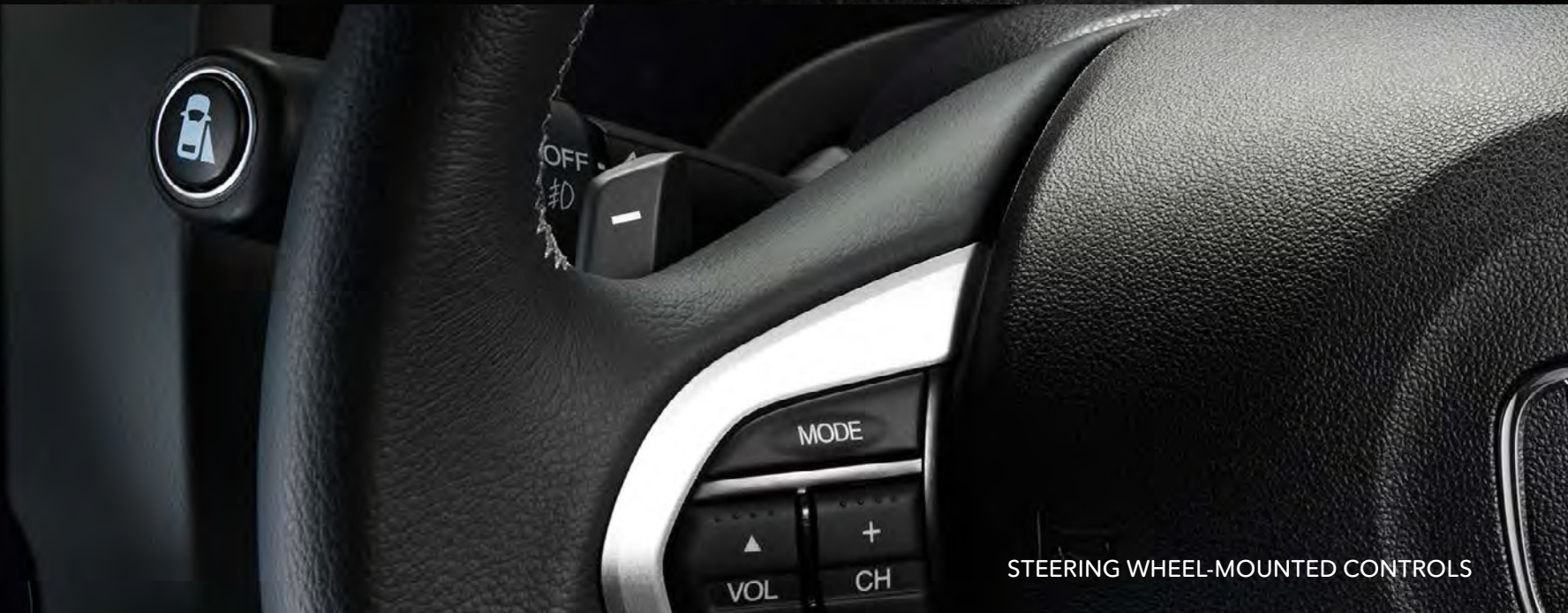
STEERING WHEEL-MOUNTED CONTROLS