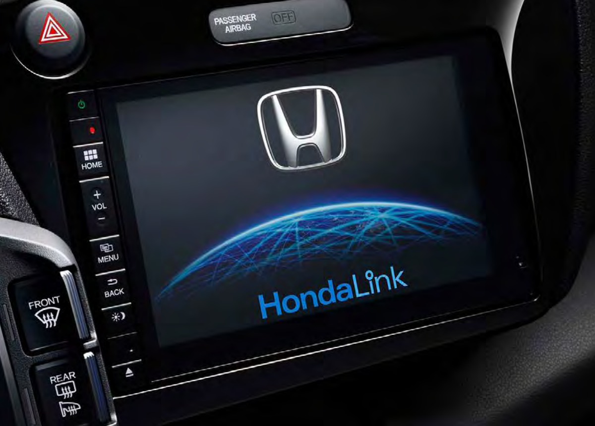
HondaLINK® 1 NEXT GENERATION