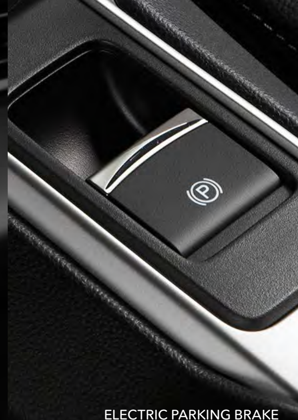
ELECTRIC PARKING BRAKE