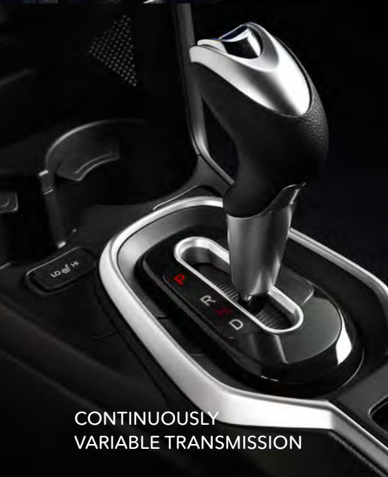
CONTINUOUSLY VARIABLE TRANSMISSION