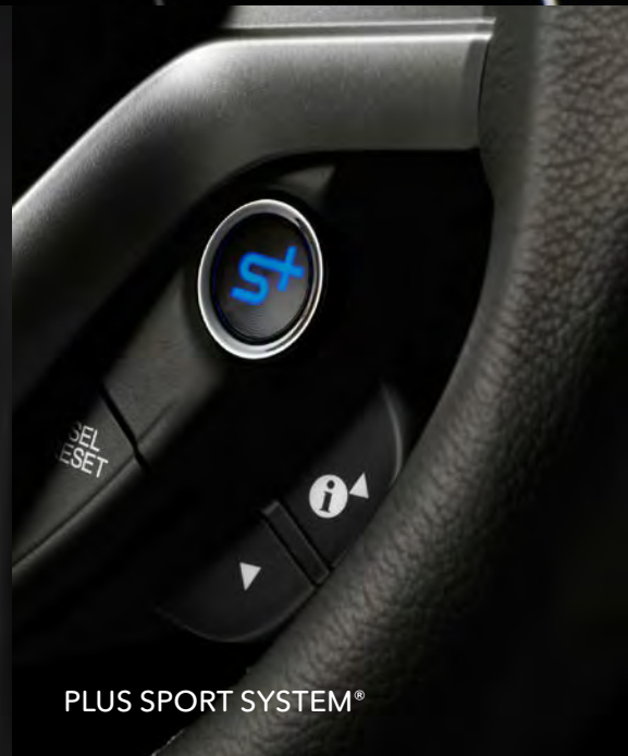
PLUS SPORT SYSTEM®