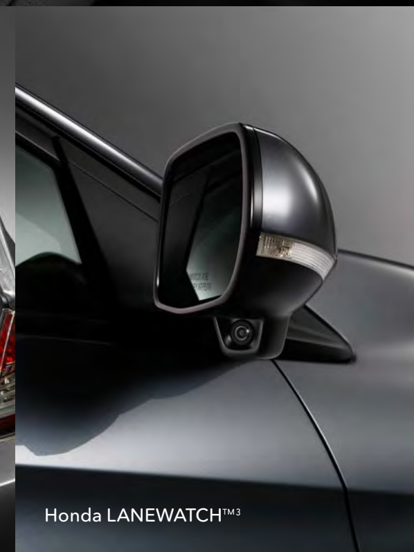
Honda LANEWATCH TM3

Honda reminds you to properly secure cargo items.