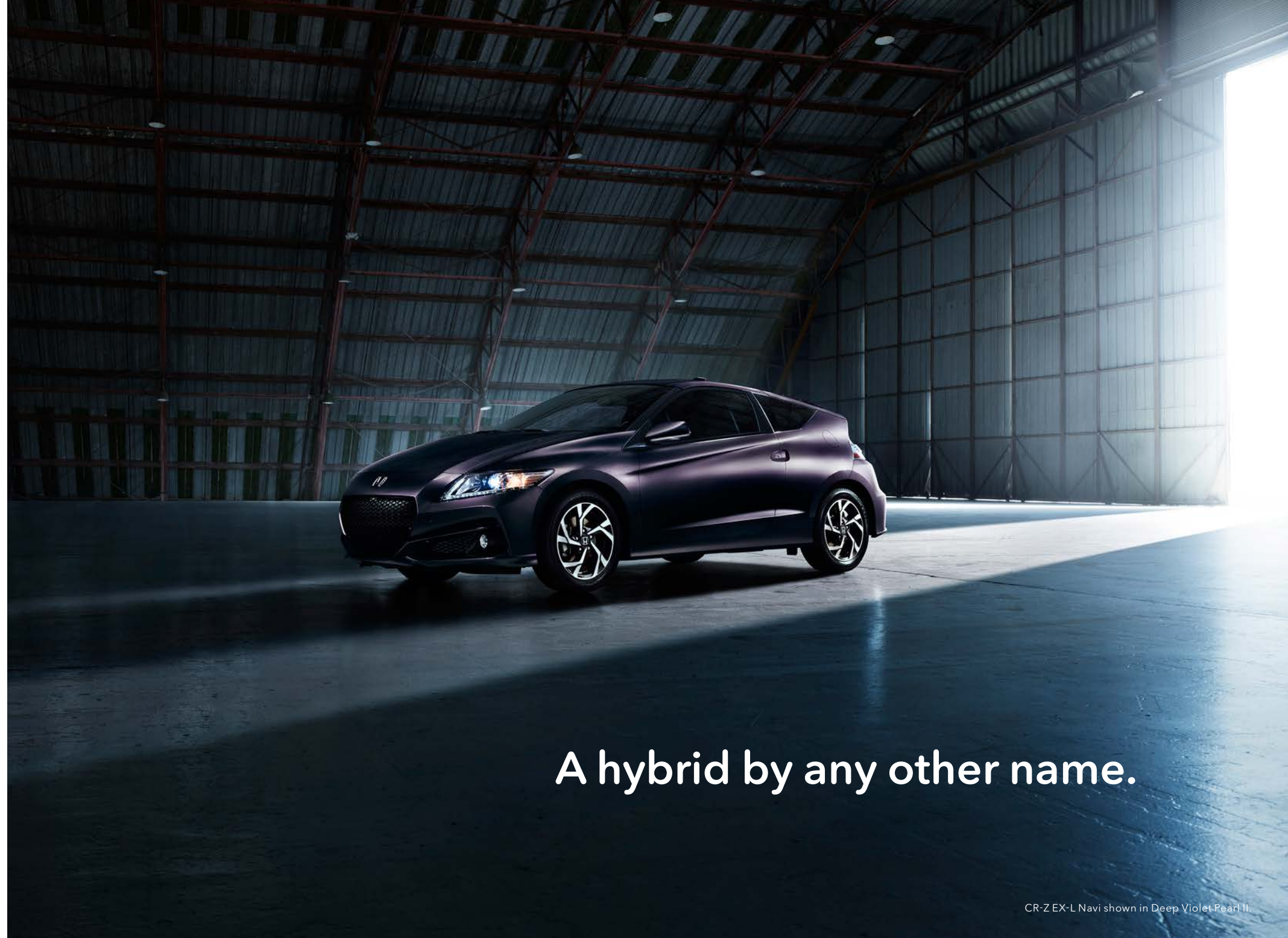
CR-Z EX-L Navi shown in Deep Violet Pearl II.