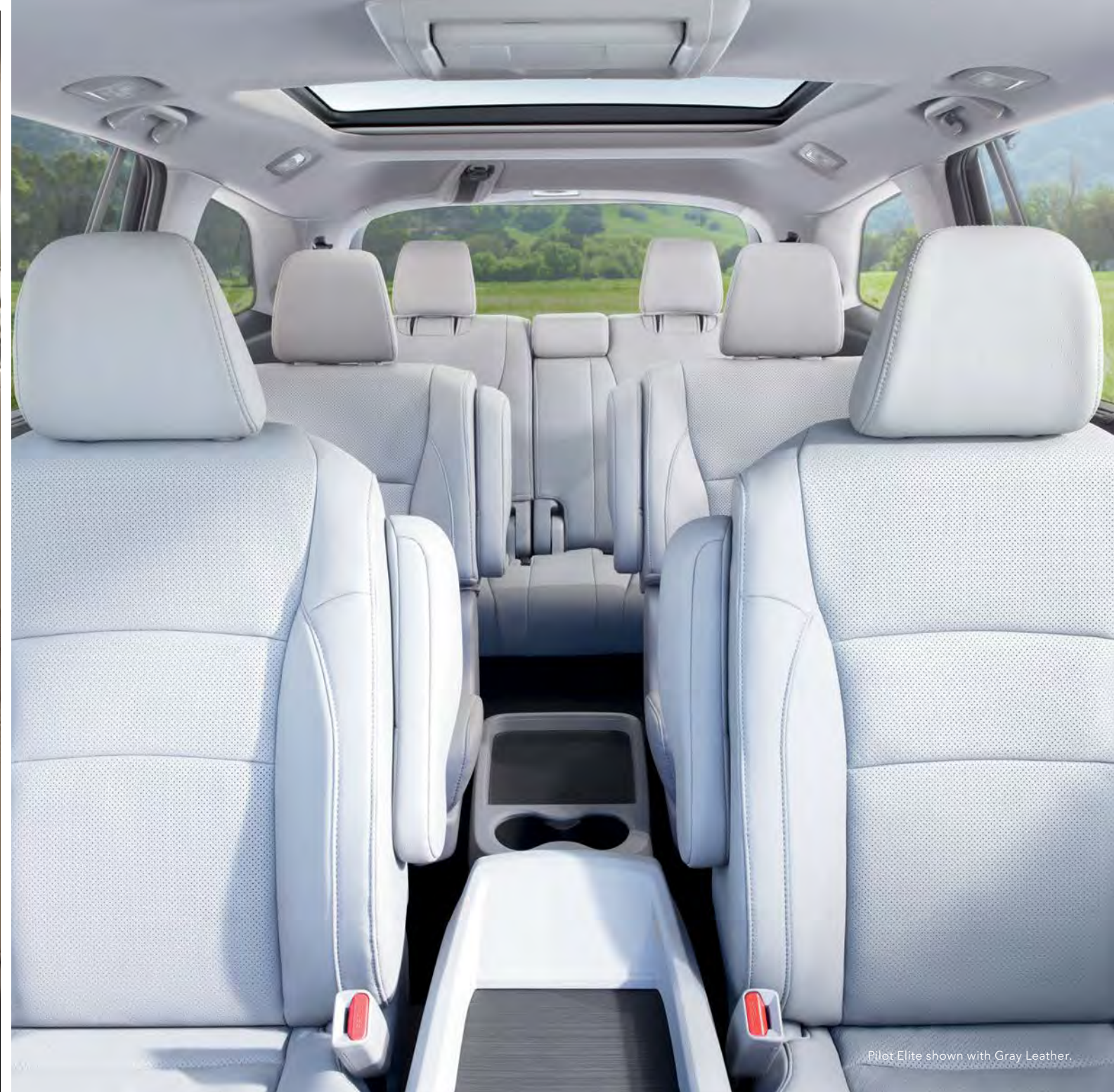
Pilot Elite shown with Gray Leather.