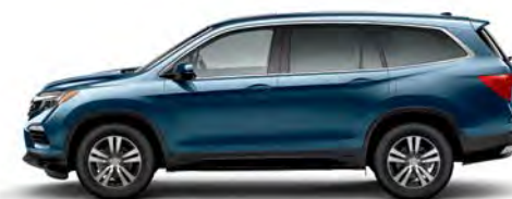
EX & EX-L