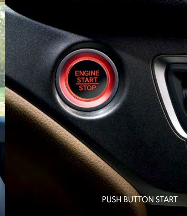
PUSH BUTTON START