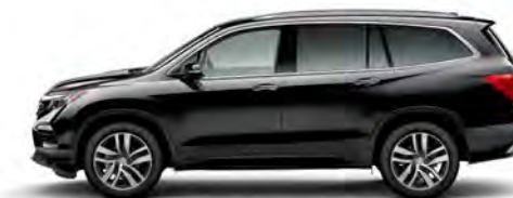
TOURING & ELITE