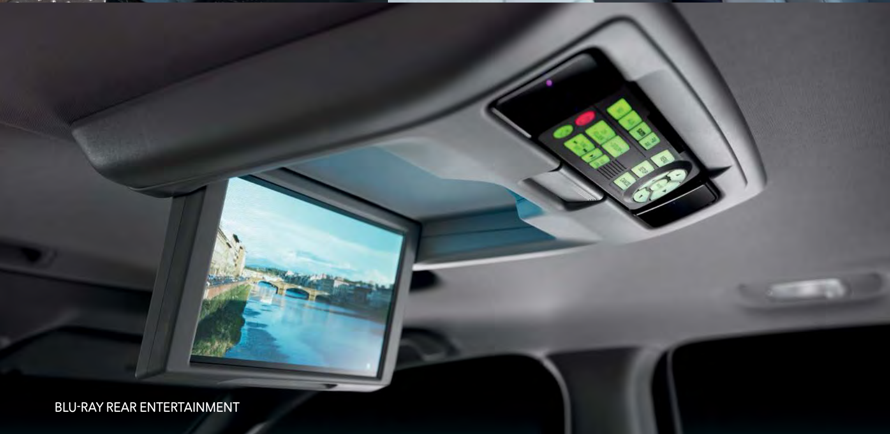
BLU-RAY REAR ENTERTAINMENT