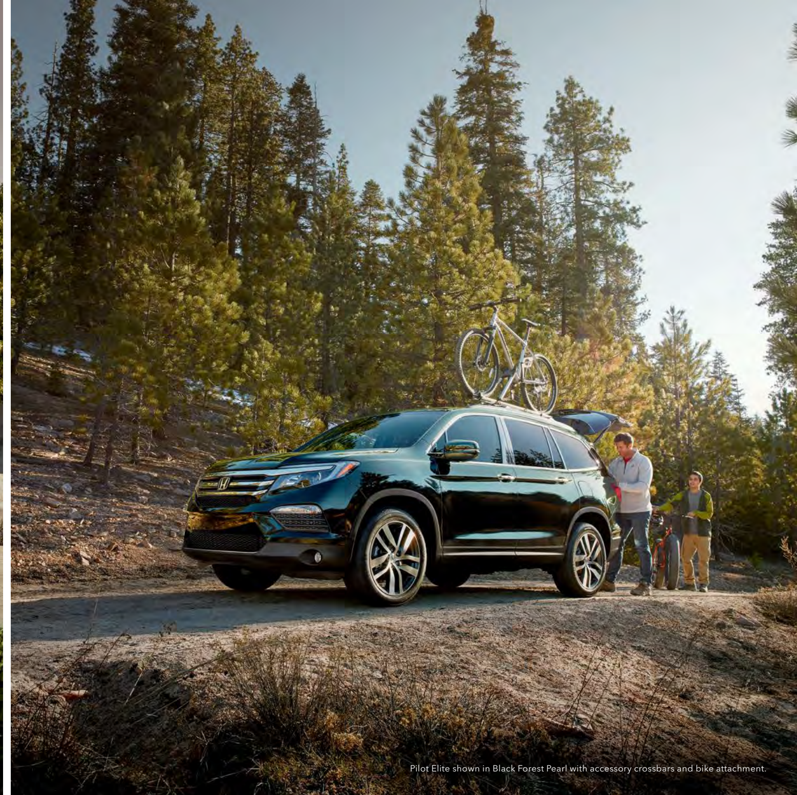
Pilot Elite shown in Black Forest Pearl with accessory crossbars and bike attachment.

The Pilot is at home wherever you park it. It's been completely restyled with a bold, new look that makes it stand out in a crowd and sleek, clean lines that help it fit in to any environment.