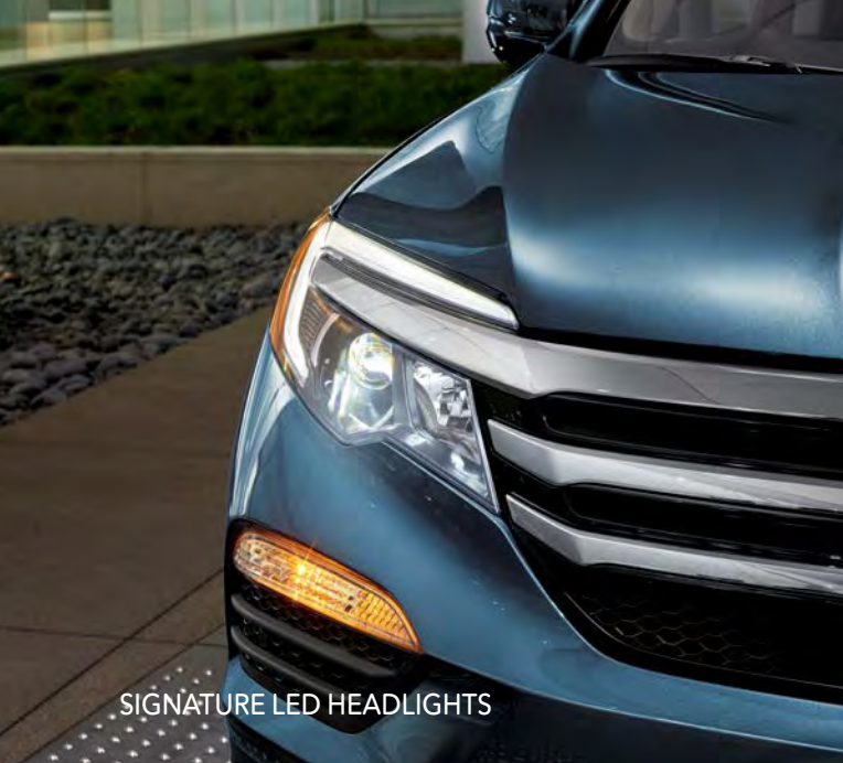
SIGNATURE LED HEADLIGHTS