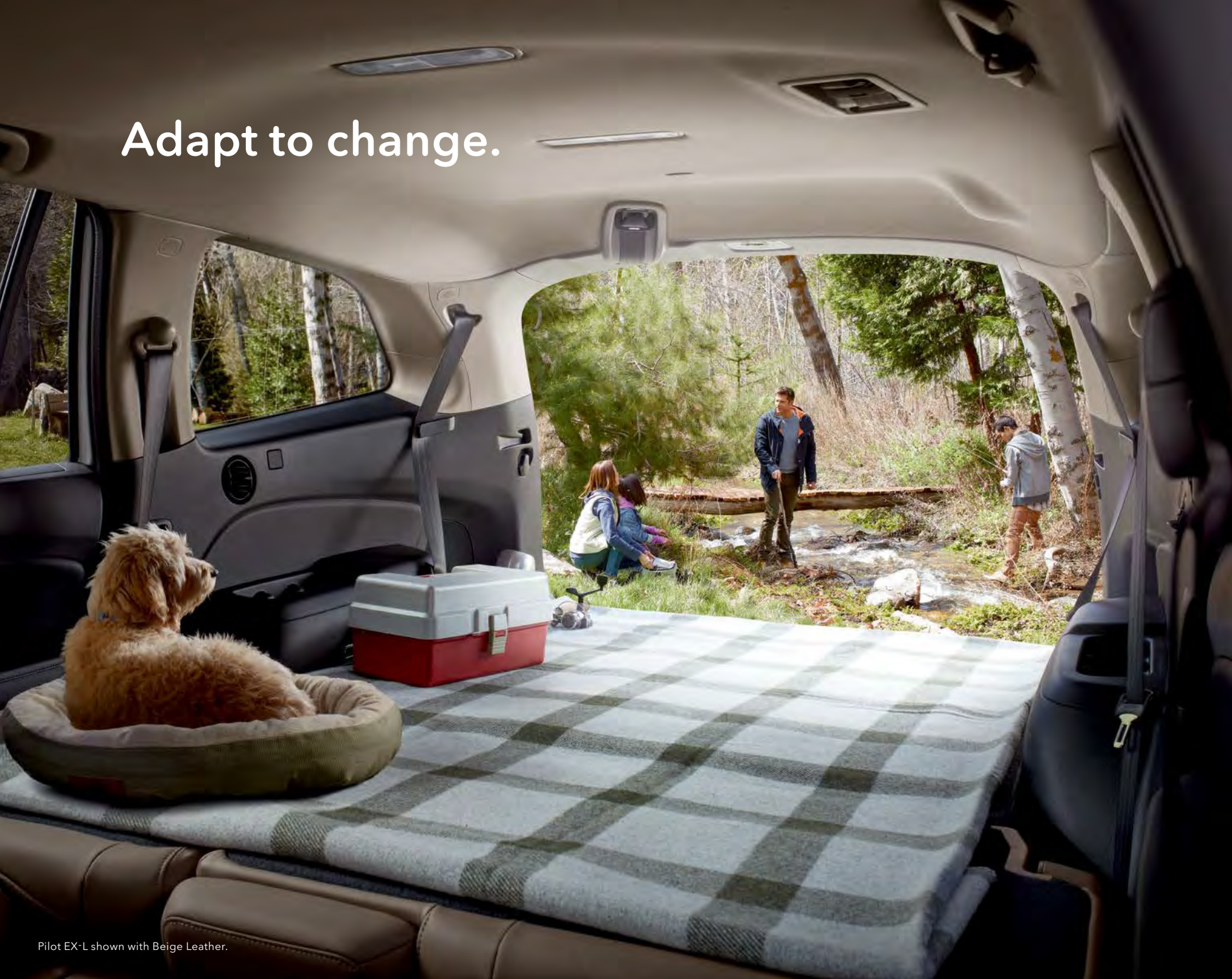
Pilot EX-L shown with Beige Leather.