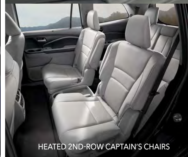
HEATED 2ND-ROW CAPTAIN'S CHAIRS