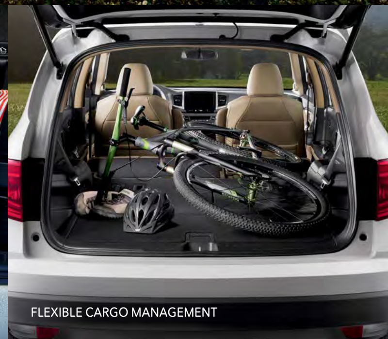
FLEXIBLE CARGO MANAGEMENT