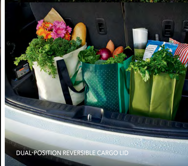
DUAL-POSITION REVERSIBLE CARGO LID