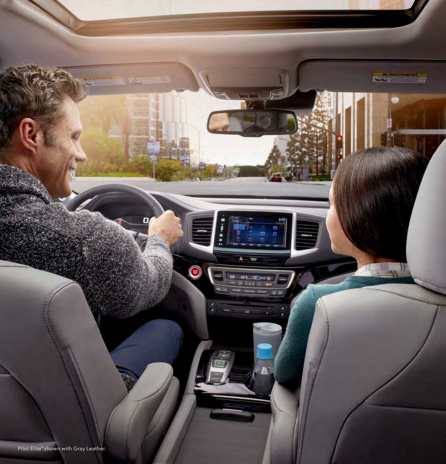
Pilot Elite® shown with Gray Leather.