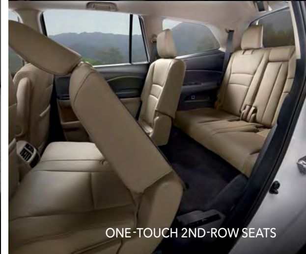
ONE-TOUCH 2ND-ROW SEATS