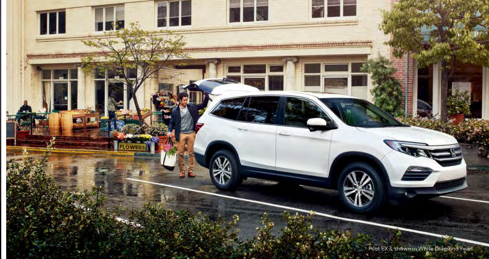
Pilot EX-L shown in White Diamond Pearl.

No two days are ever the same. So you need a vehicle that can quickly shift focus to match your evolving interests. The Pilot does just that with an agile interior delivering a seemingly limitless level of versatility.