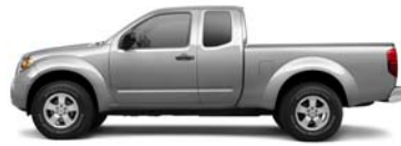
SV: KING CAB AND CREW CAB