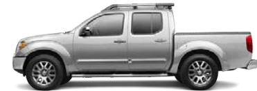
SL: CREW CAB