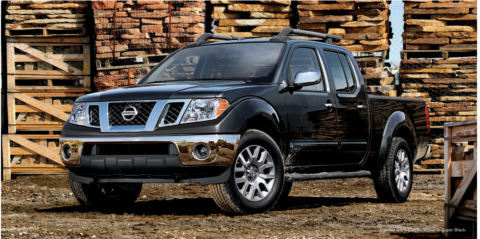
Frontier Crew Cab SL shown in Super Black.