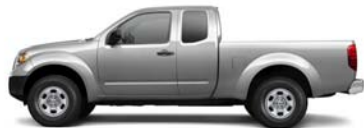
S: KING CAB AND CREW CAB