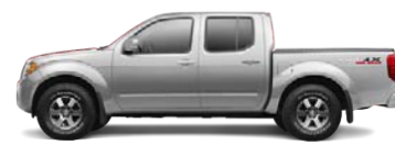
PRO-4X: KING CAB AND CREW CAB