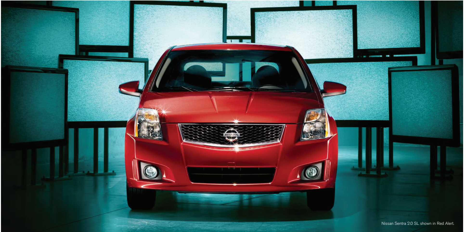
Nissan Sentra 2.0 SL shown in Red Alert.