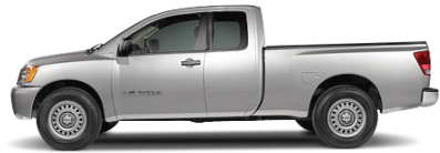
S KING CAB AND CREW CAB