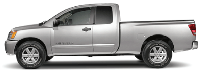
SV KING CAB AND CREW CAB