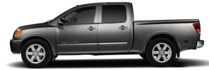
SL CREW CAB