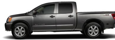
PRO-4X KING CAB AND CREW CAB