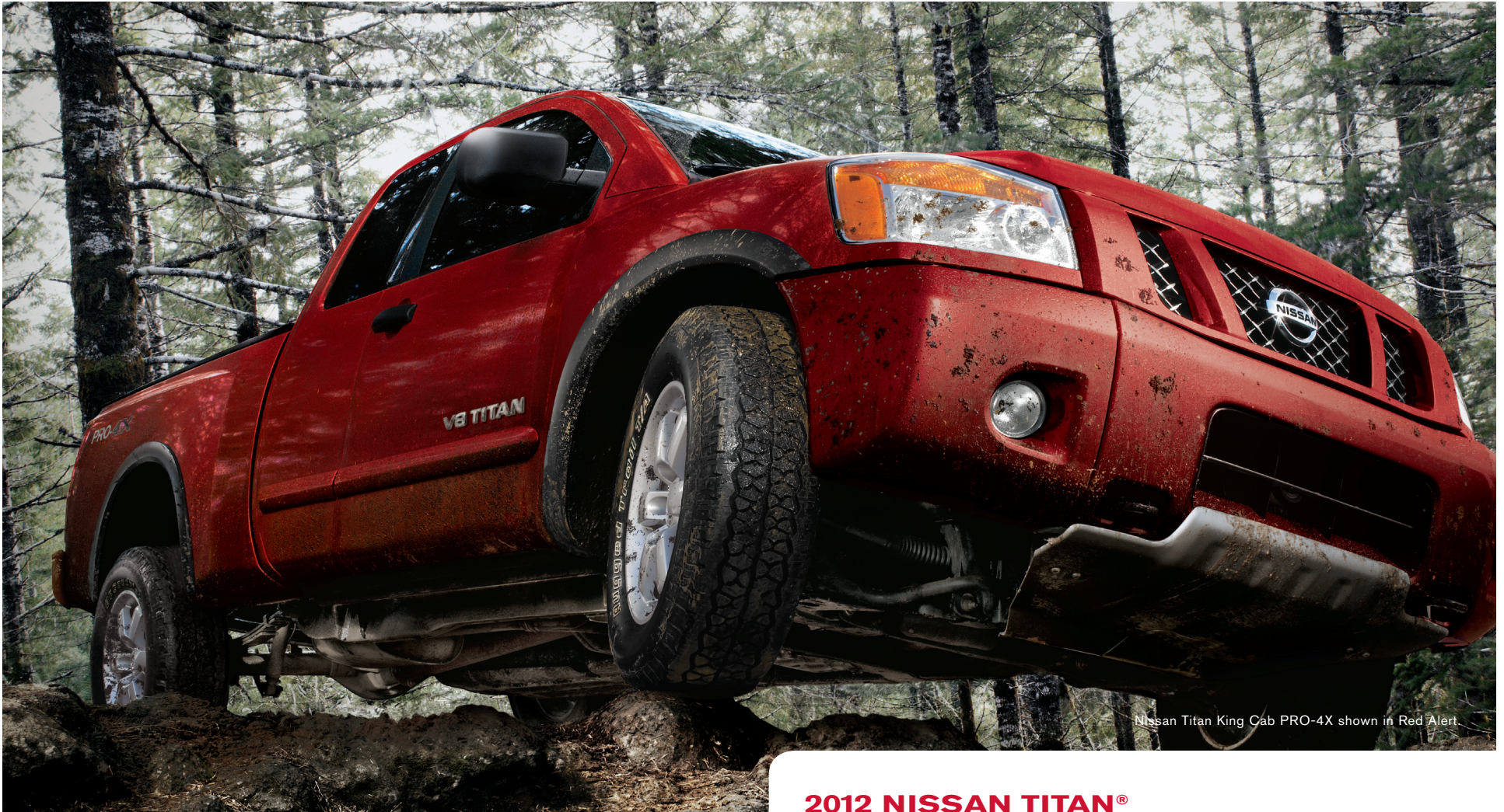
Nissan Titan King Cab PRO-4X shown in Red Alert.