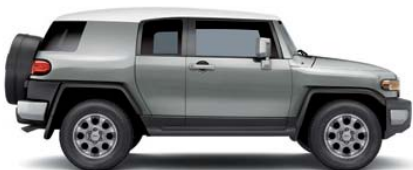
SILVER FRESCO METALLIC