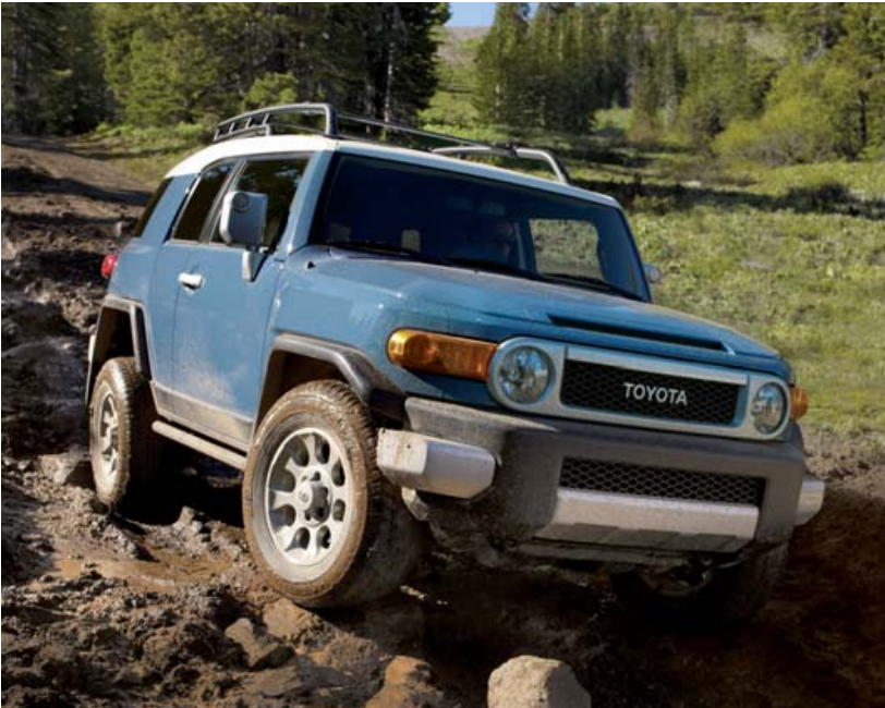
FJ Cruiser shown in Cavalry Blue with available Upgrade Package and available accessory roof rack and rock rails.