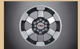
TRD 16-in. 6-spoke alloy wheels