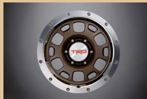
TRD 16-in. off-road beadlock-style wheels (black or bronze)