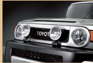
Auxiliary driving lights