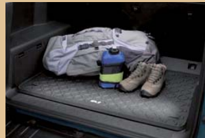
All-weather cargo mat