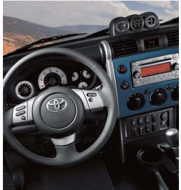
FJ Cruiser 4x4 interior shown with available Upgrade Package.

Leave no stone unclimbed. That's the spirit with which the 2012 FJ Cruiser is built. And to help it live up to that credo, it's got nearly eight inches of wheel travel in the front and more than nine in back. FJ boasts a rock-solid boxed steel ladder frame, 260 hp and 271 lb.-ft. of torque. It also offers an available locking rear differential and Active Traction Control (A-TRAC). With a rugged, versatile and easy-to-clean interior, FJ Cruiser can handle almost anything Mother Nature can dish out. Moving Forward.