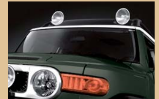
Off-road lights with air dam