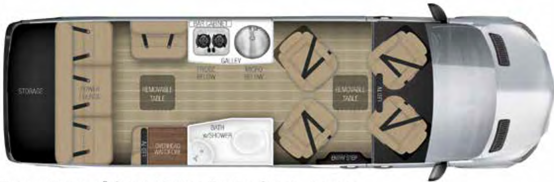
Tommy Bahama® Special Edition Touring Coach - Lounge

The gracious Lounge EXT and Grand Tour EXT floorplans provide ample space for your entire entourage. Generous panoramic windows offer breathtaking vistas. At the end of your relaxing day, the breezy, island-inspired Tommy Bahama® décor and accessories provide welcoming, well-designed touches throughout.