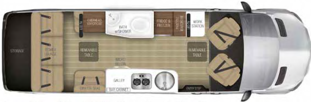
Tommy Bahama® Special Edition Touring Coach - Grand Tour