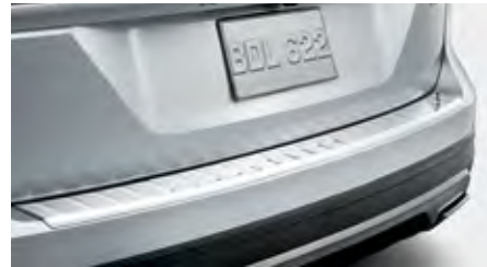
Rear Bumper Protection Plate — Chrome