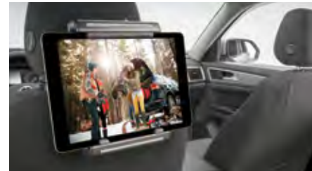
Universal Tablet Holder**