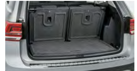
Heavy Duty Trunk Liner with Cargo Blocks and Extended Seat Back Cover

*MY2018 Atlas 6 years/72,000 miles (whichever occurs first) New Vehicle Limited Warranty. Based on manufacturers' published data on transferable Bumper-to-bumper/Basic warranty only. Not based on other separate warranties. See owner's literature or dealer for warranty limitations. **Tablet device not included.