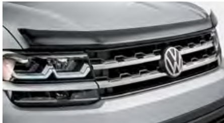
Hood Deflector — Tinted