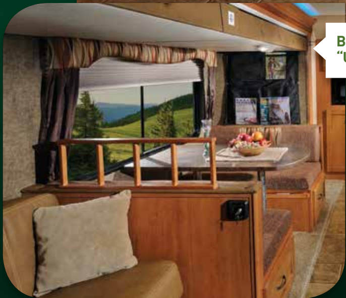
BUNKS IN THE "UP" POSITION.