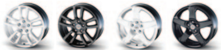
Sonic 16" Wheels