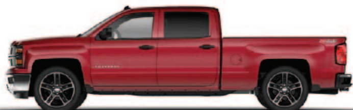
FUTURE* 22-Inch Wheel - Silver Ultra Bright Machined w/Hi Gloss Black (SEW)