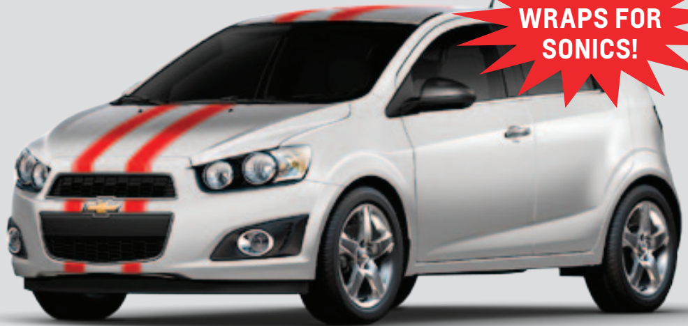
Sonic Graphic Shown: Gloss Red

Install time: 2.5 hours for each application.