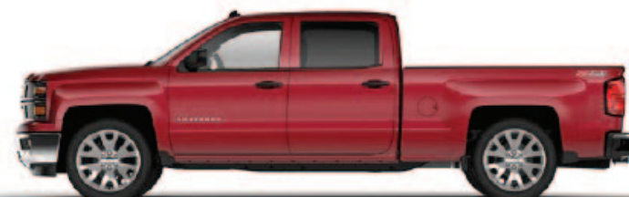
FUTURE* 22-Inch Wheel - Silver Ultra Bright Machined (SFO)