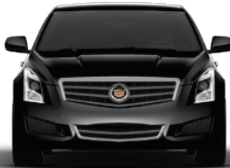
Images are for representation only and may not reflect actual product.