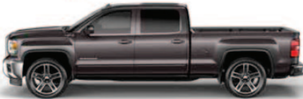
FUTURE* 22-Inch Wheel - Silver Ultra Bright Machined w/Hi-Gloss Black (SEW)