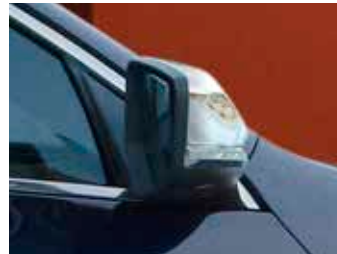
Chrome Mirror Caps