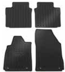
Premium All-Weather - Black