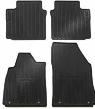
Premium All-Weather Floor Mats