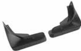
Front Molded Splash Guards