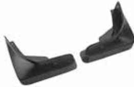
Front Molded Splash Guards