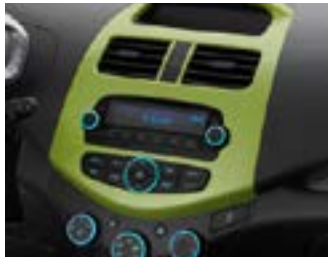
Interior Trim Kit*