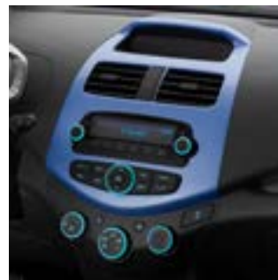
Denim Interior Trim Kit