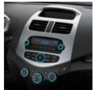
Silver Ice Interior Trim Kit