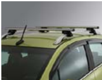
Roof Rack Cross Rails*