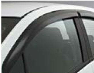
Side Window Weather Deflectors