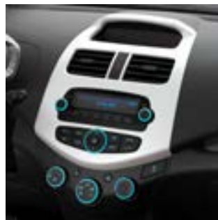
Summit White Interior Trim Kit