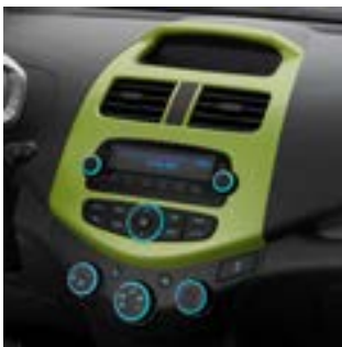
Jalapeno Interior Trim Kit