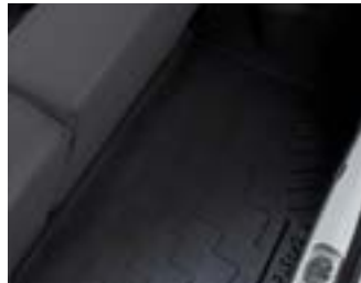
Cargo Floor Mat