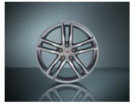
19-inch Wheel – Ultra Bright Machined (UBM) w/Sterling Silver Premium Painted Pockets

This five split-spoke aluminum alloy gloss black wheel exudes a bold, confident and aggressive attitude.