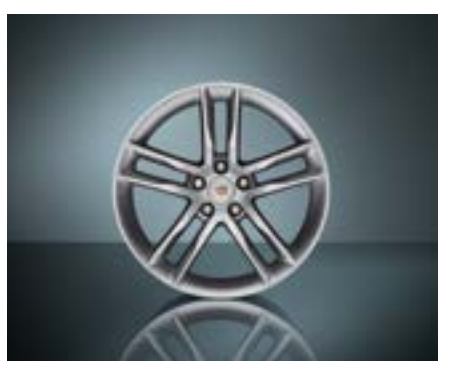
19-inch Wheel – Manoogian Silver Premium Painted

This lightweight, forged aluminum alloy five split-spoke wheel features a brilliant, machined face, adding a provocatively stylish element.