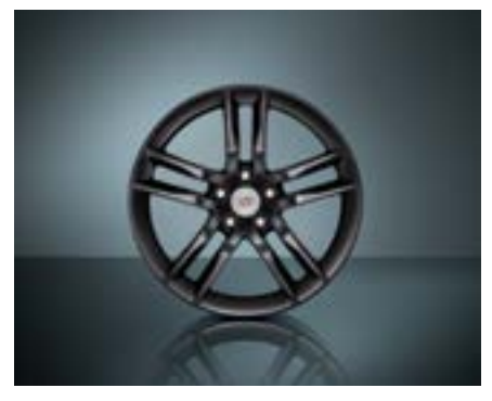
19-inch Wheel – Gloss Black Premium Painted

The 2013 Cadillac ATS is offered with three 19-inch Accessory wheels. Each is crafted to enhance the exterior appearance of the ATS and maximize vehicle performance. Shown above: 19-inch Wheels – Gloss Black Premium Painted with Silver center caps (Crest and Logo) and polished wheel locks.