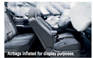
Airbags inflated for display purposes.

The Ridgeline's first line of defense is a reinforced unit body that incorporates a closed-box frame with internal high-strength steel frame stiffeners. Both the frame rails and all seven crossmembers feature box-section construction. The result is a remarkably high torsional rigidity.