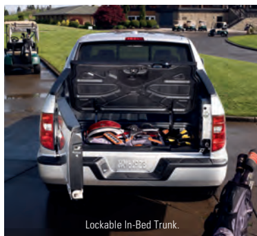
Lockable In-Bed Trunk.