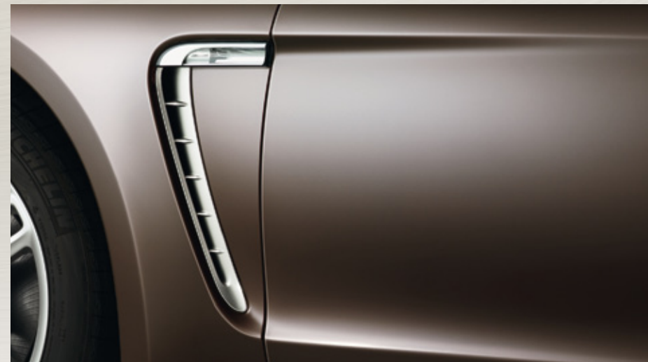
Side air outlets