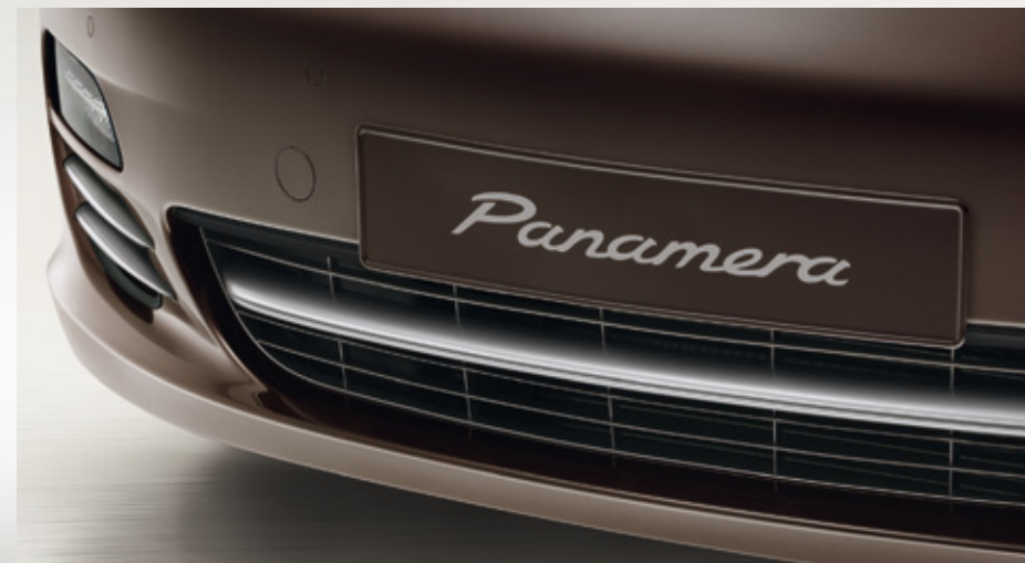
Lateral Slats in front fascia