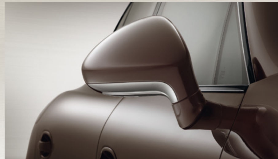
Exterior mirror lower trim

For details, please refer to the Panamera Platinum Edition price list or visit the Porsche Car Configurator at www.porscheusa.com .