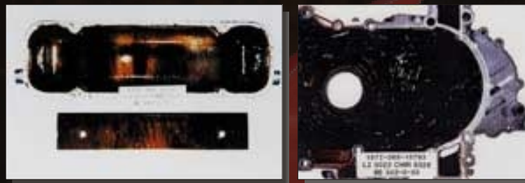
Untreated oil in this valve cover & timing gear cover failed the 64 hour test.