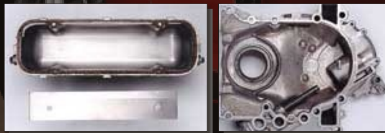
BG MOA ® prevented oil oxidation and kept the engine clean throughout a 240-hour triple-length Sequence III engine test.