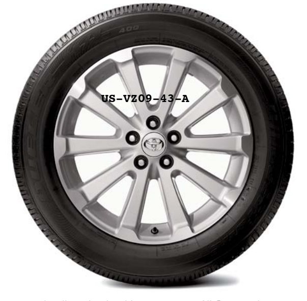
19-in. alloy wheels with P245/55R19 All-Season tires