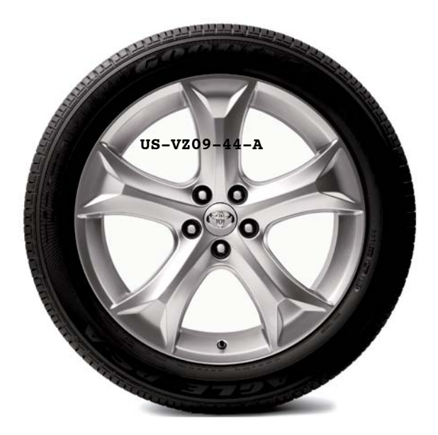
20-in. alloy wheels with P245/50R20 All-Season tires